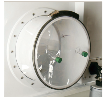
The photo sequence above shows a 18" diameter transfer port cap (flanged) with nipples being installed on a semi-rigid, germ-free isolator transfer port using a CBC Patent Clamp.*

CBC Transfer Port Caps are available in the following standard diameters: 8", 12", 18" and 24"; and the following depths: