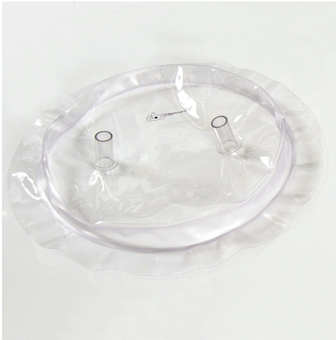
Pictured above is a 20 mil. vinyl, external transfer port cap with a flange and with nipples.