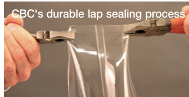
CBC's durable lap sealing process