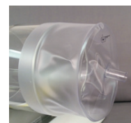
External Port Caps.