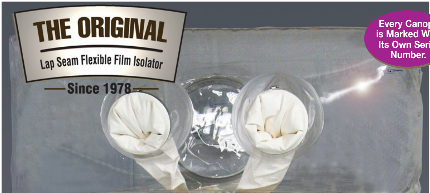
Pictured above is a 5' x 2' x 2' positive pressure, germ-free isolator canopy with glove ports, glove extensions, gloves and an 18" round transfer port.